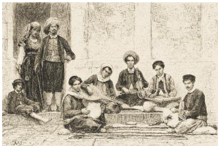
An Algerian Jewish ensemble, from 1875.

believe that the music they are set to is similarly ancient. This Medieval umbrella is then extended to cover lyric songs dating back to only the late 19th century. To ascribe this repertoire to the 15th century is just plain wrong.